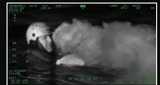
MX-15 1080p EON