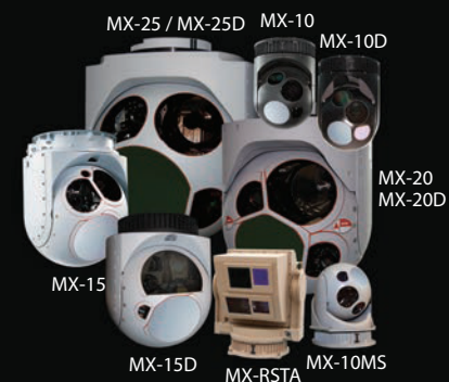
WESCAM's EO/IR/Laser Systems